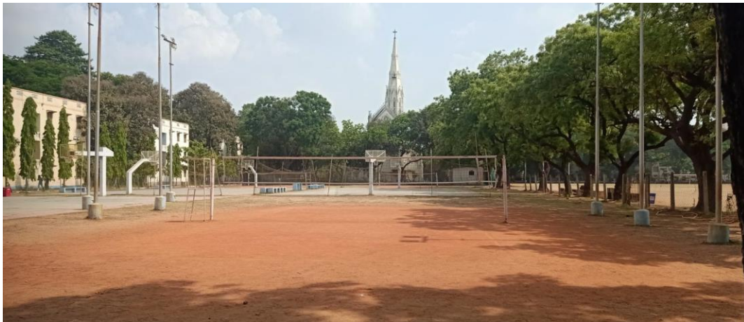
Volley ball ground & Badminton court