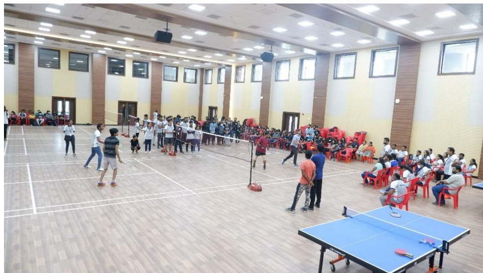
LIBA – Auditorium cum Sports Facility