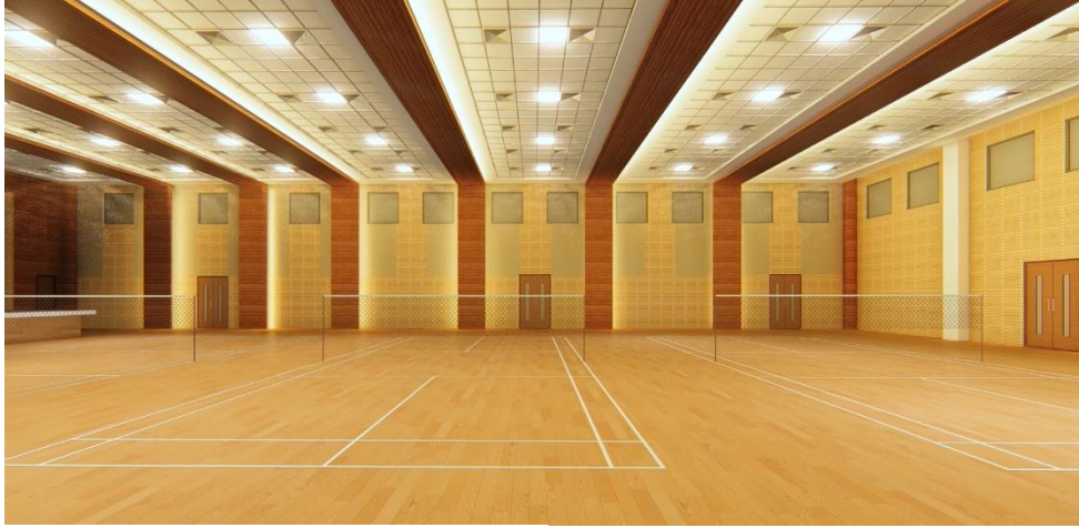
LIBA – Auditorium cum Sports Facility